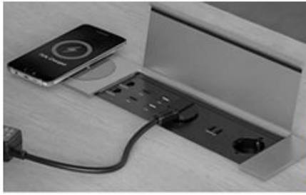
Recharger with hidden plugs