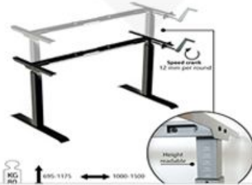
Ergonomic custom features